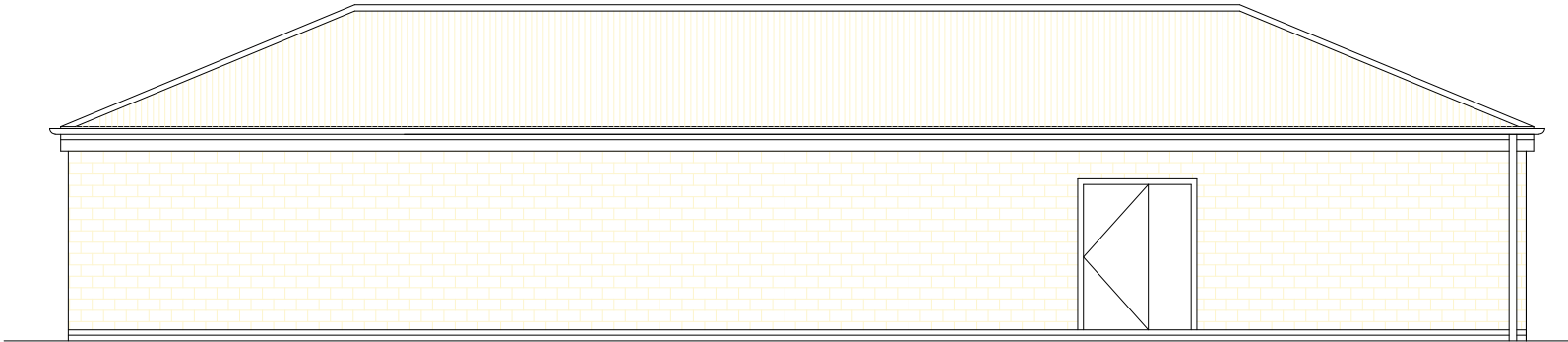
Front Elevation Pavilion with 2 team changing rooms with officials changing,