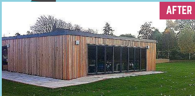
Photo is, again, a low resolution (600x238pixels), but otherwise shows a good view of the new building – if not from the same angle as the ‘before’ shot

Photo is a good illustration of the state of the area before, however is quite a poor resolution (381x221pixels)