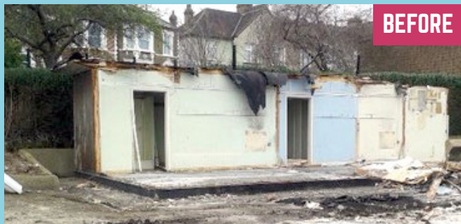
Photo is a good illustration of the state of the area before, however is quite a poor resolution (381x221pixels)