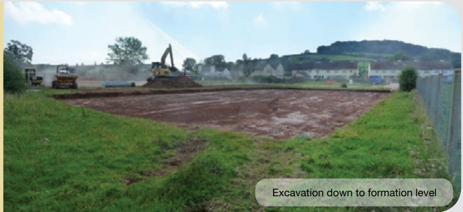
Excavation down to formation level

The project was jointly funded by Denbury Parish Hall Charity and Sport England.