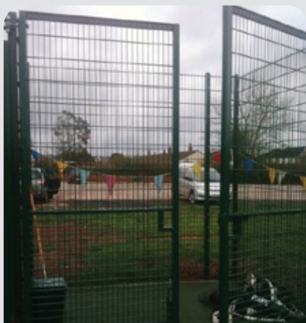
Equipment storage recess viewed from inside the MUGA