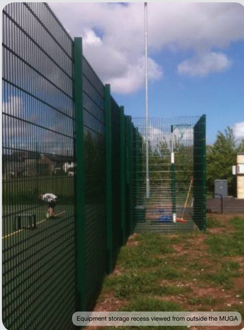
Equipment storage recess viewed from outside the MUGA