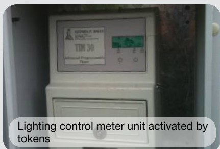
Lighting control meter unit activated by tokens

Typically, floodlit MUGAs would be alongside a pavilion or clubhouse, with the facility management staff controlling court use and lighting. As this operational model was not financially feasible within the business plan, a decision was taken to minimise management by adopting a 'pay-as-you-go' system using tokens available from the nearby village shop and pub. This also enables activation of the floodlighting and access to the sports equipment in the lockable outdoor store and shed, which would normally be kept in a clubhouse. Through careful planning and management of this arrangement, facility and operating costs have been significantly reduced.