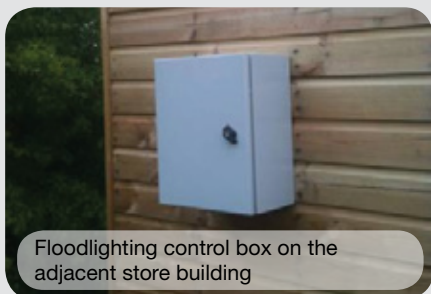
Floodlighting control box on the adjacent store building