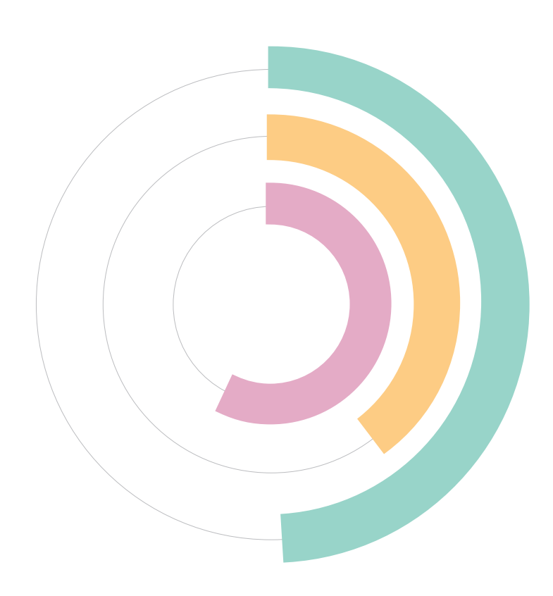
Figure 1: The conversion rates for all of the GHGA projects

Total no. of people engaged in all GHGA projects: